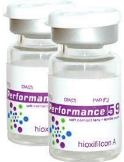
fitting guide available