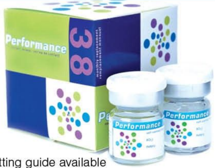
fitting guide available

2 AND 4 PACK ORDERS Initially, 1 lens will be sent per eye. If the lenses are satisfactory, contact customer service within 30 days to send remaining lenses.