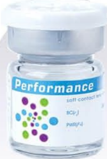
fitting guide available

material polymacon with UV 38% water color handling tint, clear*, or enhancement tint* thickness 0.1mm @ -3.00D replacement 3 to 12 months (3 months recommended) markings 3 marks 15° separation (toric only) design lenticulated, multi-aspherical front with asymmetrical duel reverse prism stabilization aspherical back oz, aspherical pc & comfort edge. Lathe-Cut.